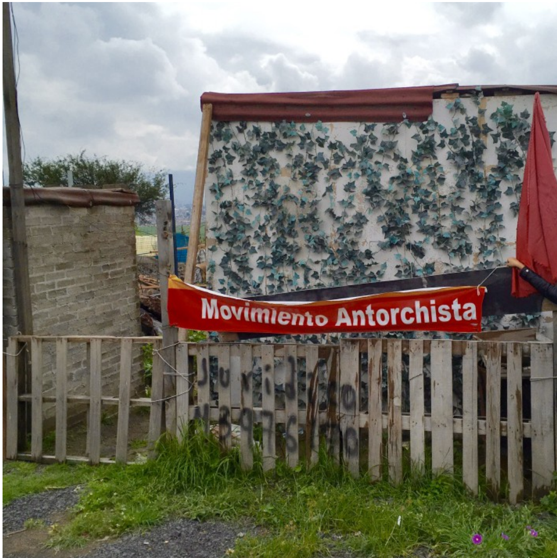
Figure 4. Real de San Martín, in the municipality of Valle de Chalco Solidaridad

[It's down to t]he leaders, basically. They need to work with us more.