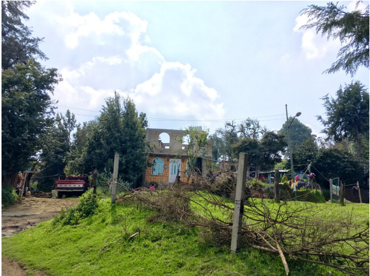
Figure 2. The informal settlement of Sifón, in the borough of Tlalpan