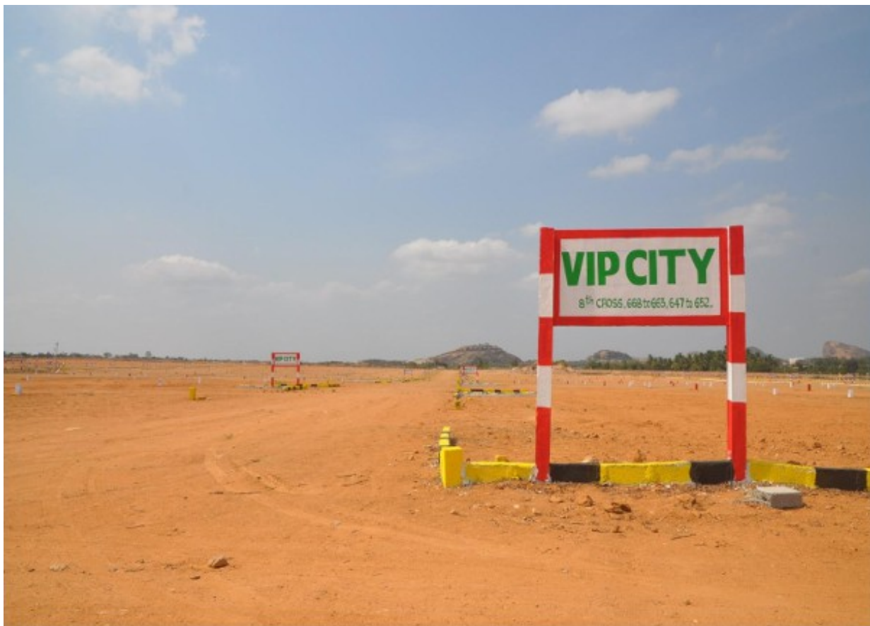
Figure 3. VIP City, Kolathur, Tamil Nadu, India, March 2011 (plots that have been sold and resold, but still not developed as of February 2016)

The powerful dynamics of land conversion complicate and aggravate urban environmental questions. These processes effectively sterilize large areas, including some of the most fertile land. They lead to the transformation and irreversible filling-in of reservoirs, drains and irrigation canals. They are therefore closely linked to environmental disasters and are often the cause of floods incorrectly blamed on climate change.