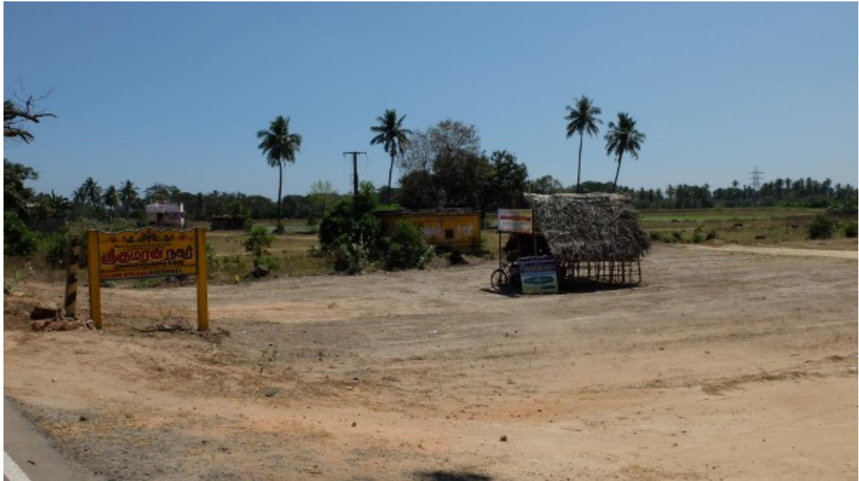
Figure 1. Sale of lots for development, Sri Kumaran Nagar project, Bahour, Puducherry, India, March 2015