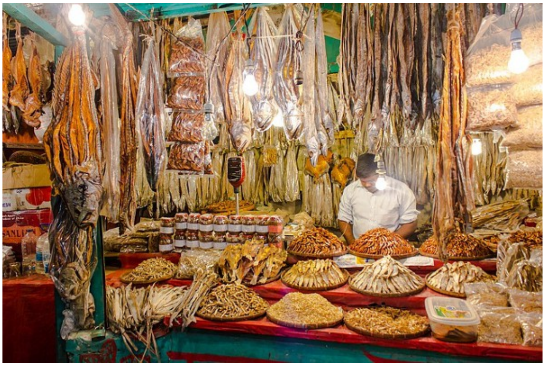
Figure 3. A dried-fish market in Chittagong, Bangladesh