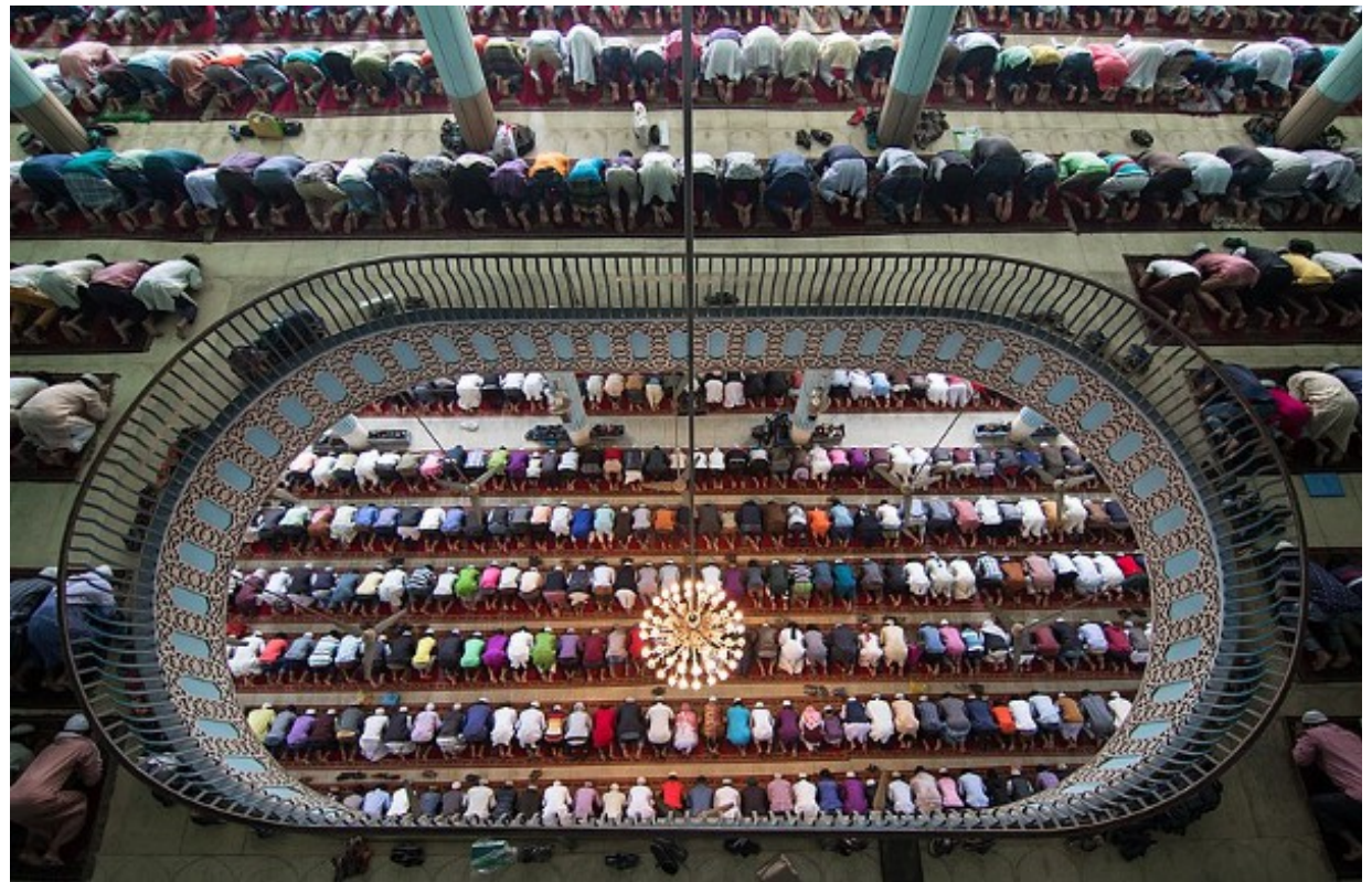
Figure 5. People praying in congregation at Baitul Mukarram National Mosque in Dhaka, Bangladesh; Muslims are obligated to pray five times daily